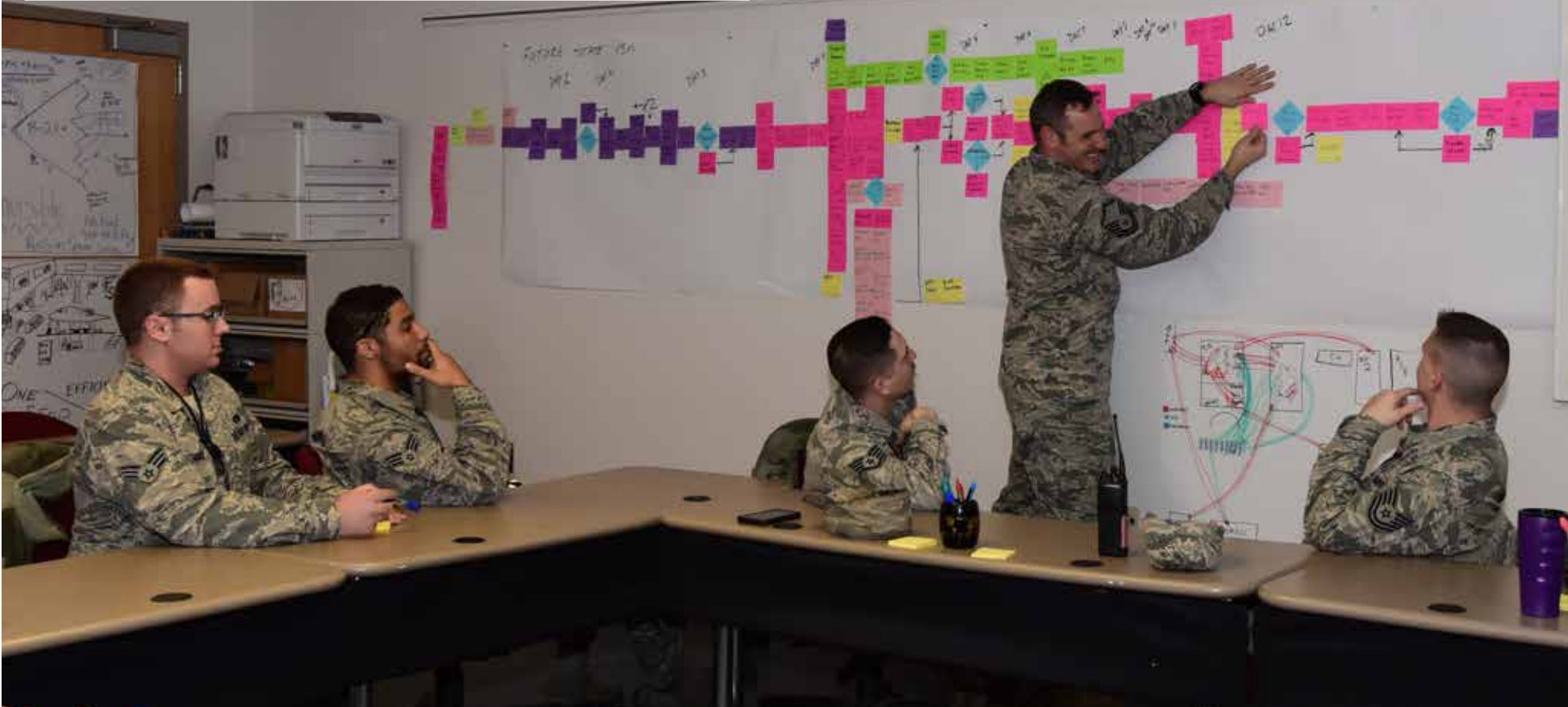
Airmen with the 509th Maintenance Squadron work with sticky notes to explain the new inspection process for the B-2 Spirit on Jan. 14, 2019 at the 509th Communications Squadron building on Whiteman Air Force Base, Missouri. The sticky notes were used to visually compare the old and new processes and allow things to be adjusted as needed.

Potential innovators can submit their ideas to save money, save time or save lives at https://www.whiteman.af.mil/Edge/ .