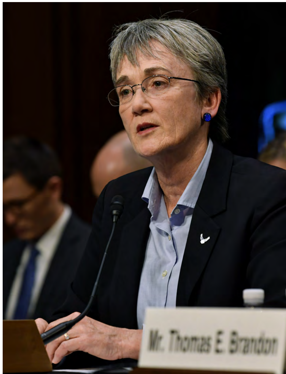
Secretary of the Air Force Heather Wilson testifies before the Senate Judiciary Committee in Washington, D.C., Dec 6, 2017.

Additionally, the budget proposal includes funds for training and for modernizing live and virtual ranges and infrastructure that provide realistic — and crucial — training capabilities against the most advanced threats.